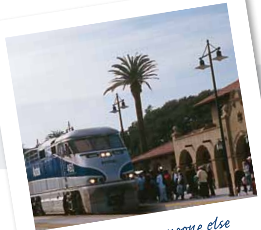
Relax... and let someone else do the driving...