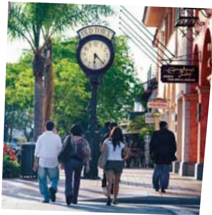
Stroll up State Street for shopping and dining...