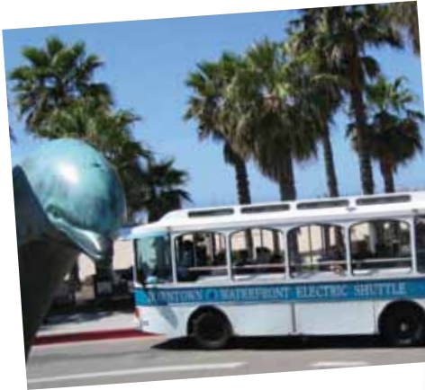
Hop on the 25¢ electric shuttle...

Our partnership: we are a cooperative project, founded in 1998 and led by Santa Barbara County Air Pollution Control District, with support from the City of Santa Barbara, Amtrak California®, and more than 100 businesses, agencies, organizations and individuals.