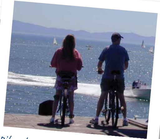
Bike along the beach and waterfront...